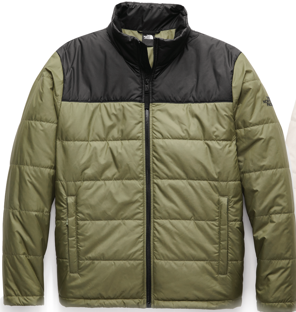
The North Face® Everyday Insulated Jacket NFOA529K | Adult Sizes: XS-3XL | 3 colors