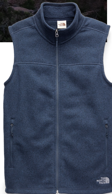
The North Face® Sweater Fleece Vest NFOA47FA Adult Sizes: S-3XL 3 Colors