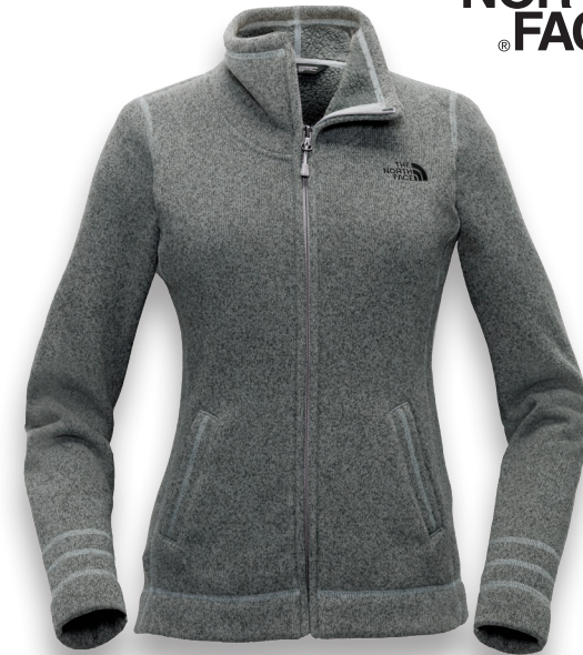
The North Face® Ladies Sweater Fleece Jacket NFOA3LH8 Ladies Sizes: S-2XL 2 Colors