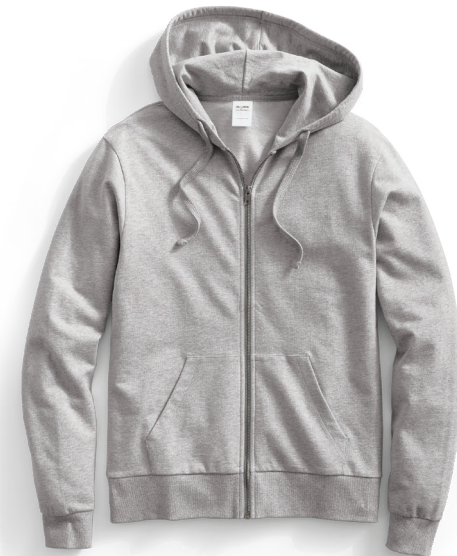
Allmade® Unisex French Terry Full Zip Hoodie AL4002 | Unisex Sizes: XS-4XL | 4 colors