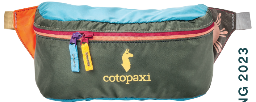
Cotopaxi Bataan Hip Pack COTOBFP | Color: Surprise