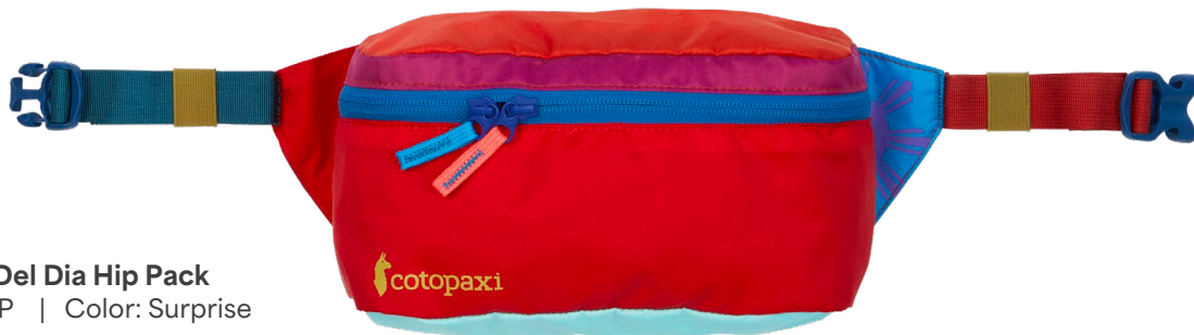
Cotopaxi Del Dia Hip Pack COTODDFP | Color: Surprise