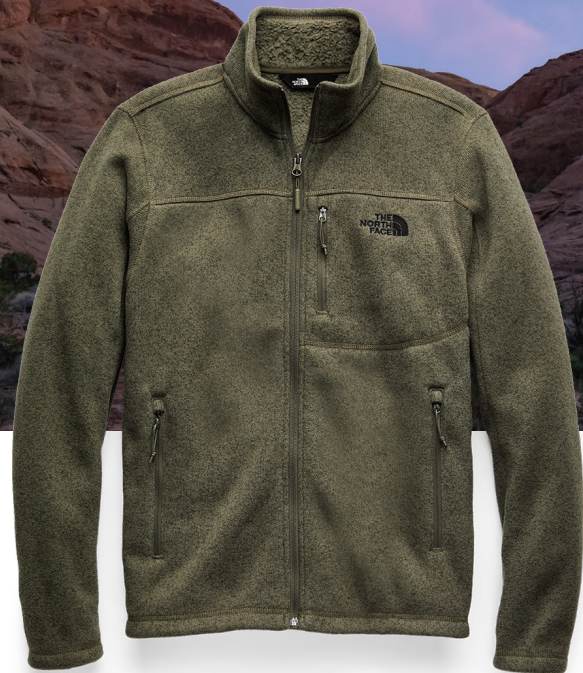
The North Face® Sweater Fleece Jacket NFOA3LH7 Adult Sizes: S-3XL 4 Colors