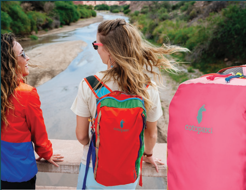
Cotopaxi Batac Backpack COTOBTP | Color: Surprise