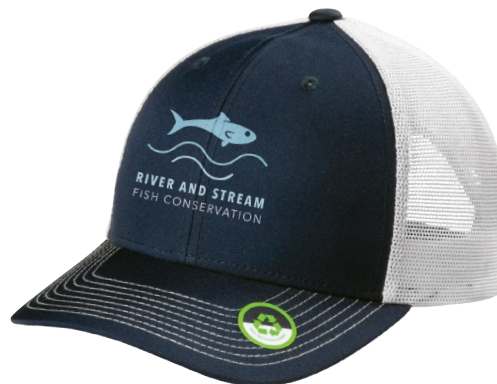
Port Authority® Eco Snapback Trucker Cap C112ECO | 5 colors