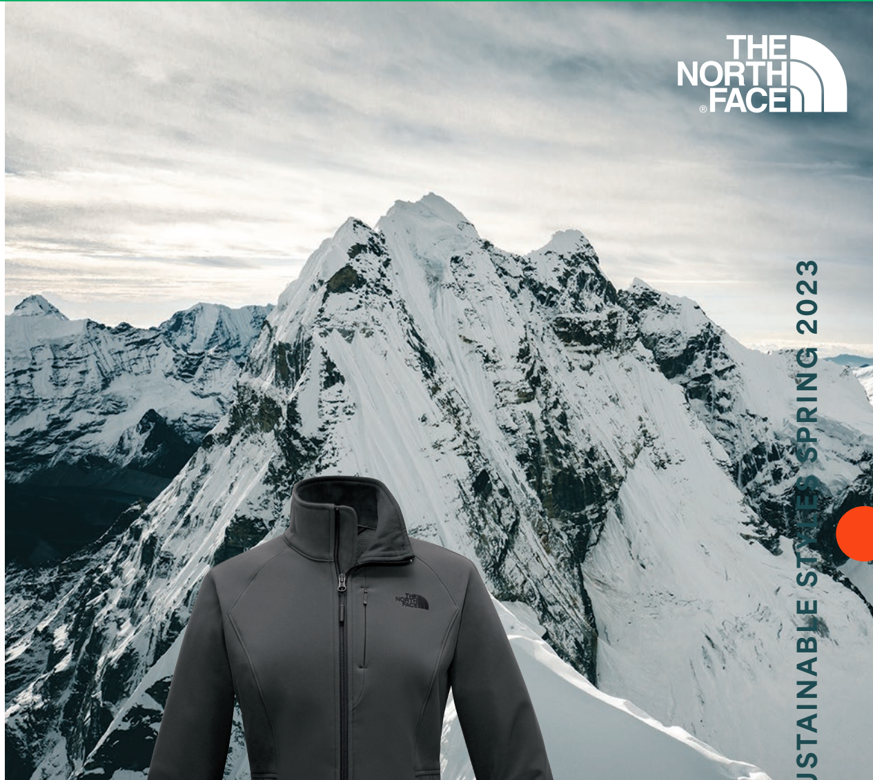
The North Face® Ladies Apex Barrier Soft Shell Jacket NFOA3LGU Ladies Sizes: S-2XL 3 Colors