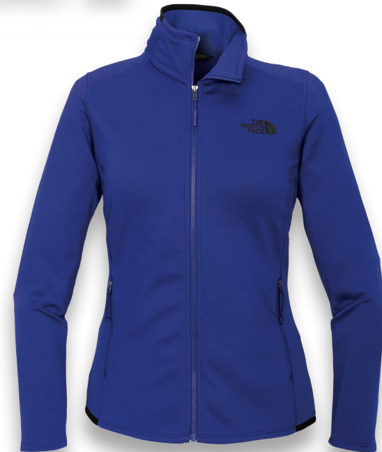
The North Face® Ladies Skyline Full-Zip Fleece Jacket NFOA7V62 | Ladies Sizes: S-2XL | 5 colors