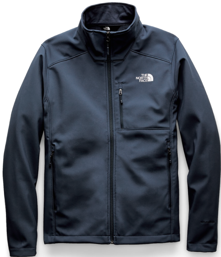
The North Face® Apex Barrier Soft Shell Jacket NFOA3LGT Adult Sizes: S-3XL 4 Colors