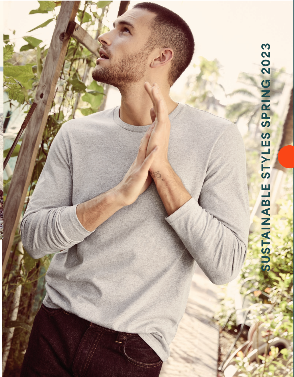
FREE District® Re-Tee® Long Sleeve DT8003 | Adult Sizes XS-4XL | 5 colors