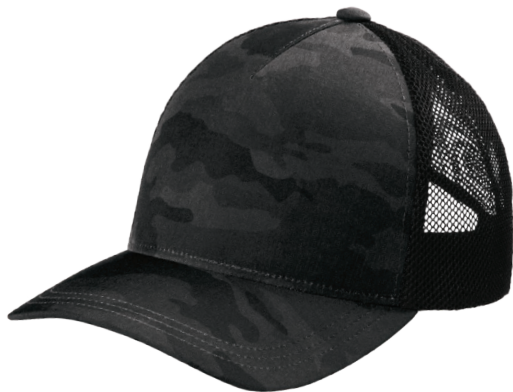
OGIO® Fusion Trucker Cap OG603 | One Size Fits Most | 3 colors