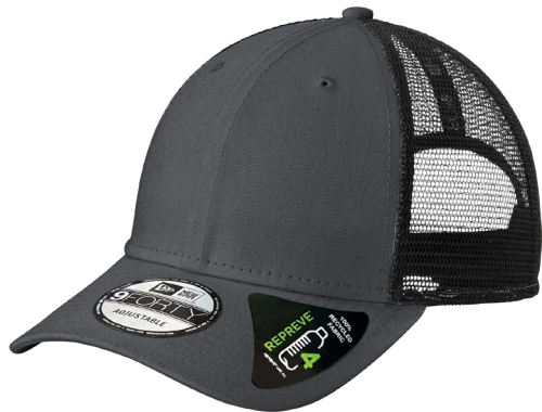
New Era® Recycled Snapback Cap NE208 | 5 colors