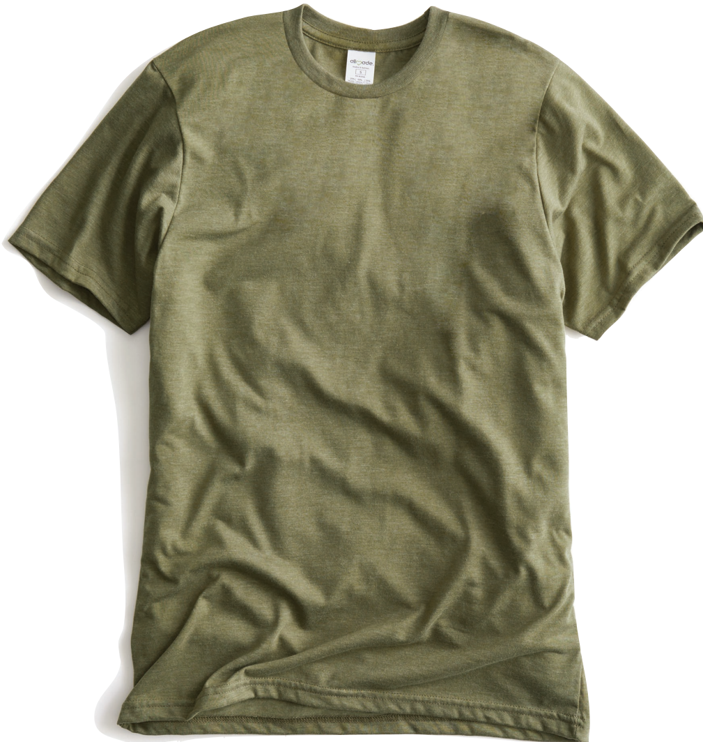
FREE Allmade® Unisex Tri-Blend Tee AL2004 | Unisex Sizes: XS-4XL | 9 colors

Feel your impact in this crazy-soft sustainable tees.