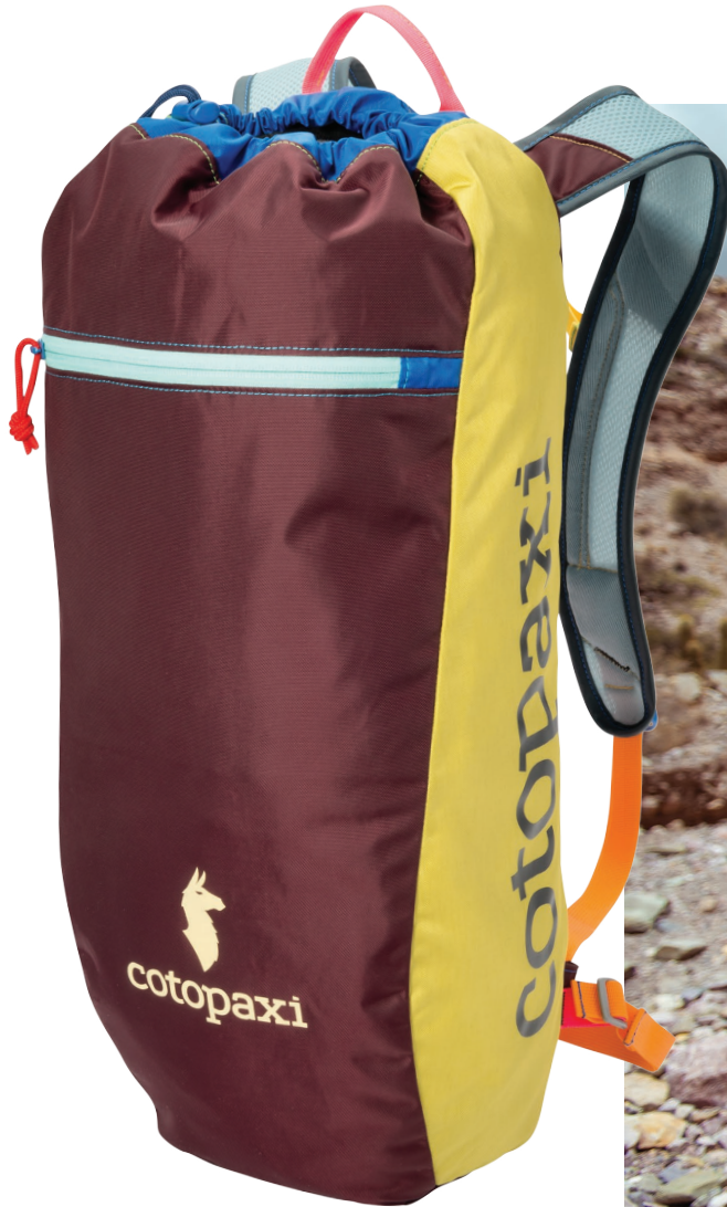
Cotopaxi Luzon Backpack COTOL18L | Color: Surprise

Each pack comes with a unique surprise color combination, made from a collection of fabric remnants.