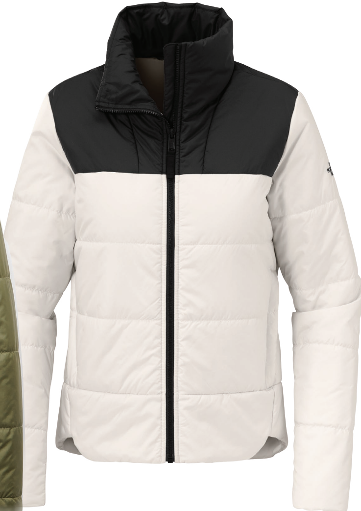
The North Face® Women's Everyday Insulated Jacket NFOA529L | Adult Sizes: XS-2XL | 3 colors