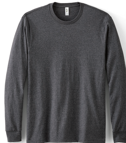
Allmade® Unisex Long Sleeve Recycled Blend Tee AL6204 | Unisex Sizes: XS-4XL | 3 Colors