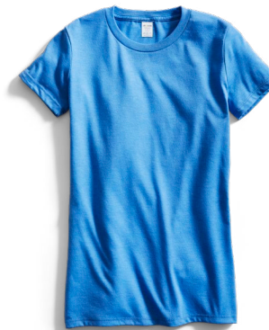
FREE Allmade® Youth Tri-Blend Tee AL207 | Youth Sizes: XS-XL | 7 colors