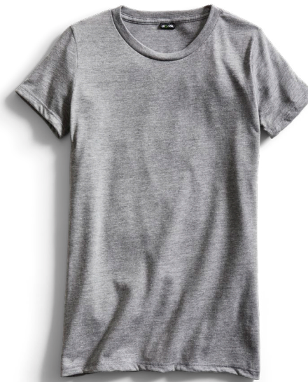
FREE Allmade® Women's Tri-Blend Tee AL2008 | Women's Sizes: XS-2XL | 9 colors