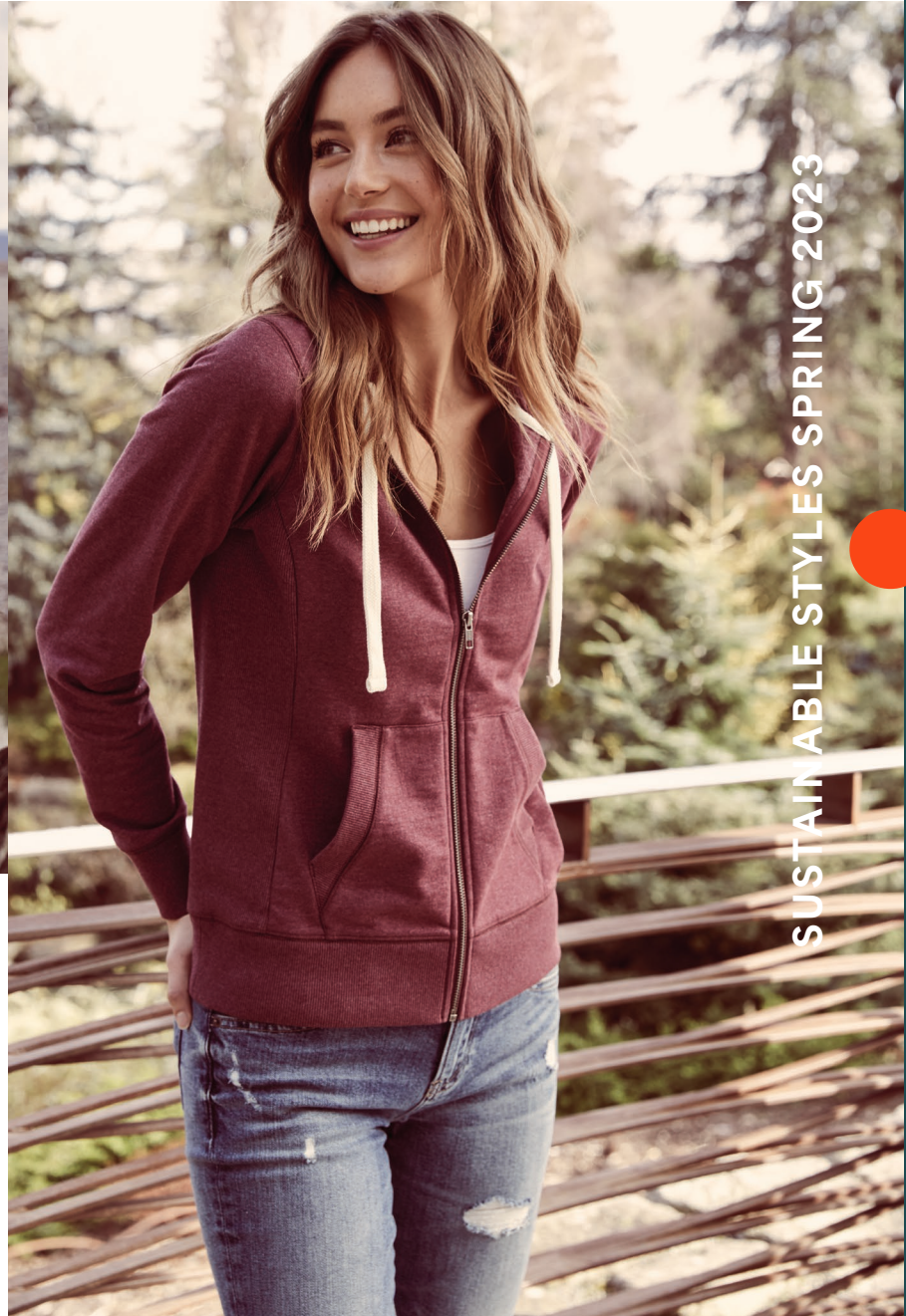
District® Women's Re-Fleece™ Full-Zip Hoodie DT8103 | Adult Sizes: XS-4XL | 5 colors