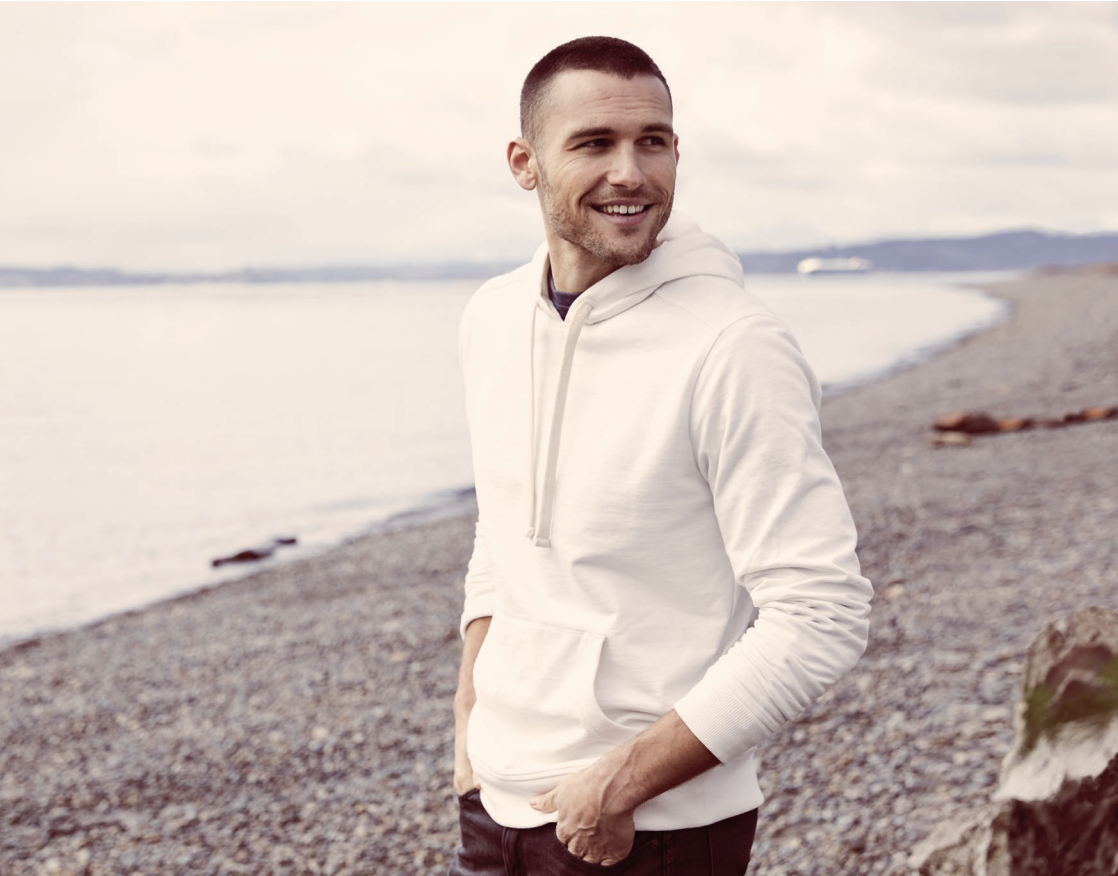
District® Re-Fleece™ Hoodie DT8100 | Adult Sizes: XS-4XL | 7 colors