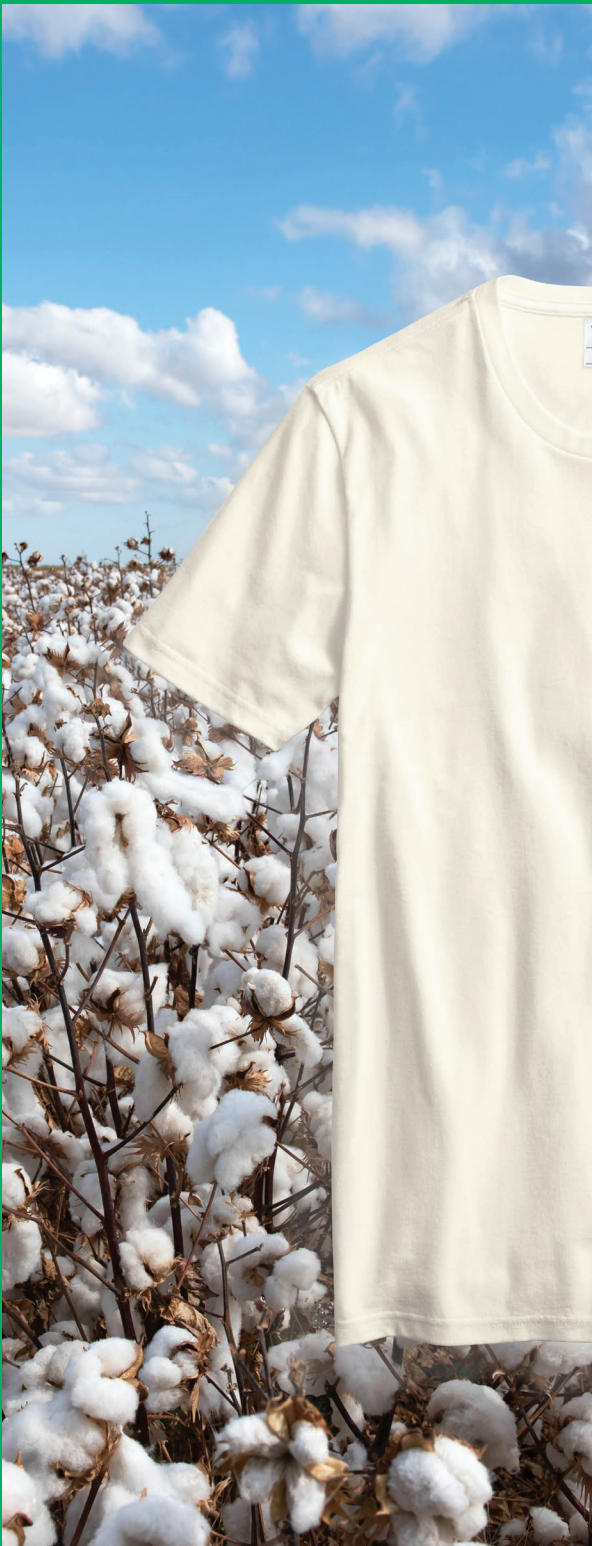
FREE Allmade® Unisex Organic Cotton Tee AL2100 | Unisex Sizes: XS-4XL | 8 colors