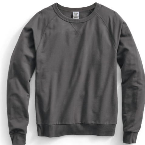
FREE Allmade® Unisex French Terry Crewneck Sweatshirt AL4004 | Unisex Sizes: XS-4XL | 4 colors