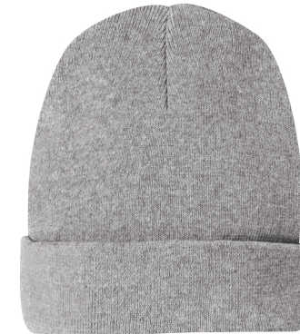
District® Re-Beanie™ DT815 | One Size Fits Most | 4 colors