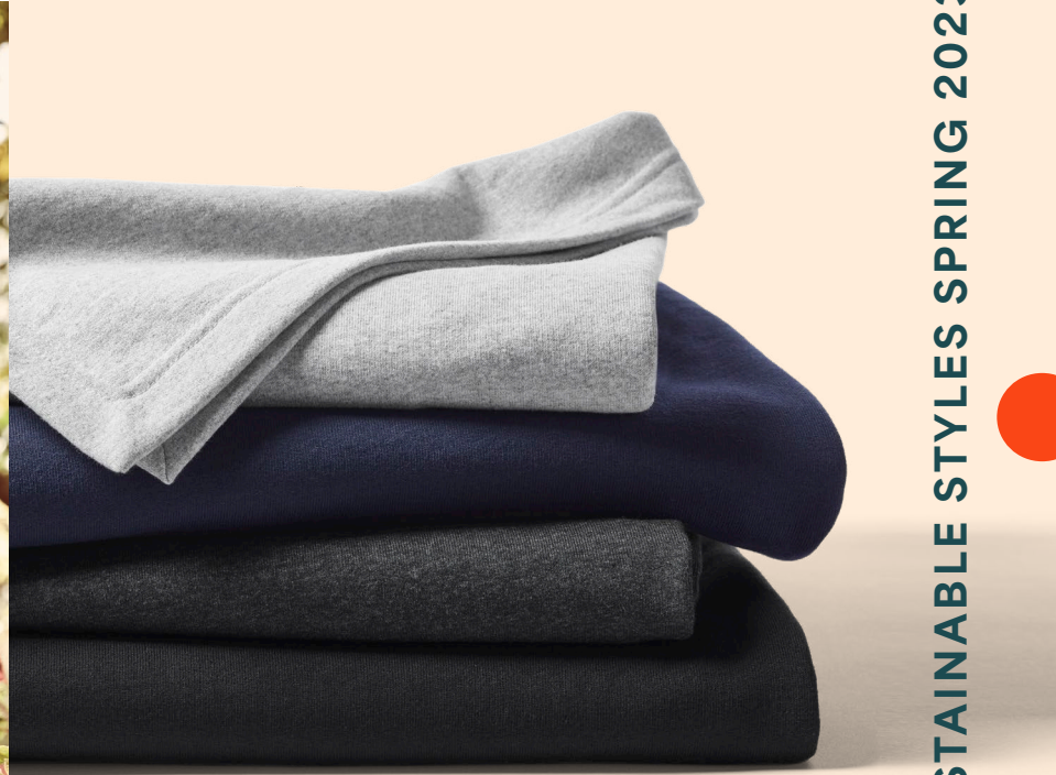
District® Re-Blanket™ DT81 | 4 colors