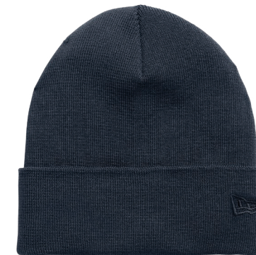
New Era® Recycled Cuff Beanie NE907 | One Size Fits Most | 3 colors