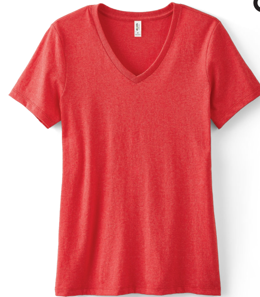
Allmade® Women's Recycled Blend V-Neck Tee AL2303 | Women's Sizes: XS-4XL | 4 Colors