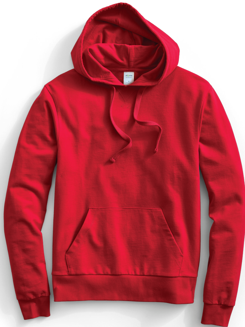
Allmade® Unisex French Terry Pullover Hoodie AL4000 | Unisex Sizes: XS-4XL | 6 colors

Allmade French terry styles and cotton tees are made from 100% organic cotton fabric.