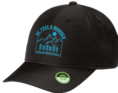
Port Authority® Eco Cap C954 | 4 colors